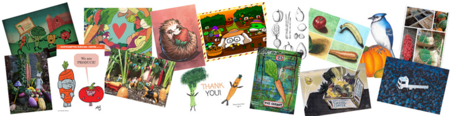
Images from the 2022/2023 Northampton Survival Center gratitude postcard project

These cards are intended to express our gratitude to the monthly donors who support our work and to inspire them to express gratitude to their own loved ones (by having donors send a postcard every month to someone they're honoring with their donations to the Center). We are currently working on a series of cards to be distributed in January 2024.